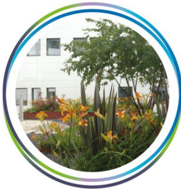
John Radcliffe Hospital