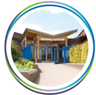
Horton General Hospital