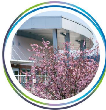
Nuffield Orthopaedic Centre